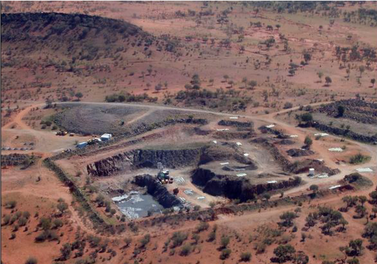
Figure 2: Molyhil Open Pit