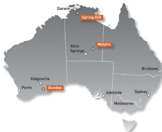
Figure 1: Thor Mining PLC project locations